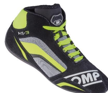
374 new Black/fluor yellow