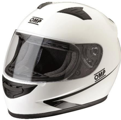
020 - white

New color matt black for CIRCUIT and STAR helmets, technical features and white versions doesn't change.