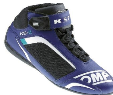
242 discontinued Blue/black