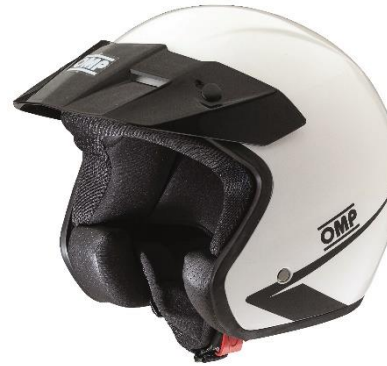
020 - white