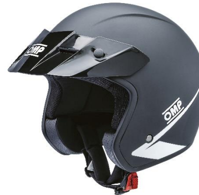
170 - matt black new

New spare peak for Star helmet: SC153 (black) and SC178 (white). SC030 and SC031 discontinued.