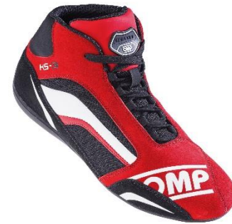
060 new Red/black