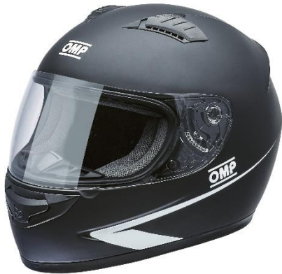
170 - matt black new